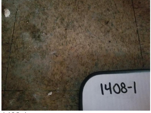
1408-1 9"x9" Floor Tile/Mastic Interior Bathrooms (Approx. 70' sq.) 9"x9" Tile: 2% Chrysotile