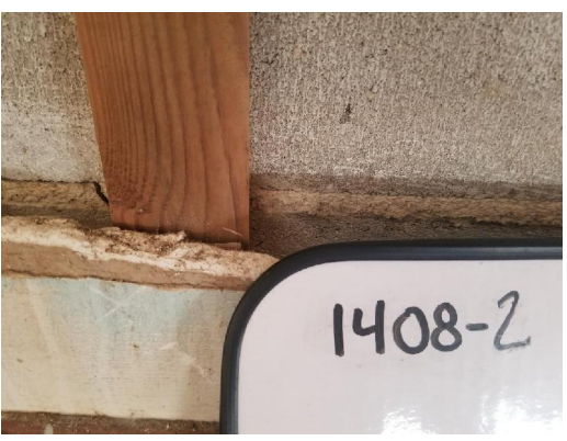
1408-2 Drywall/Joint Compound Typical Interior Walls