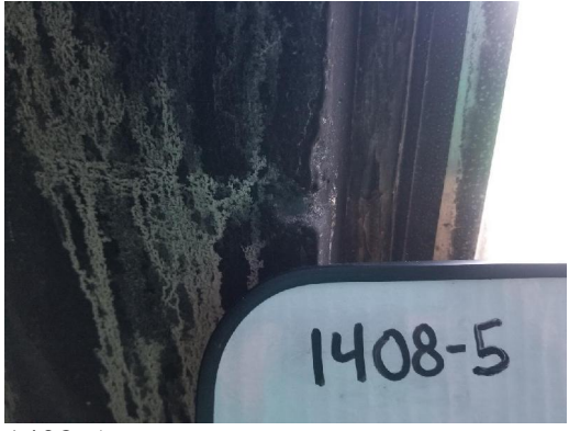
1408-5 Window Caulk Typical Interior Windows