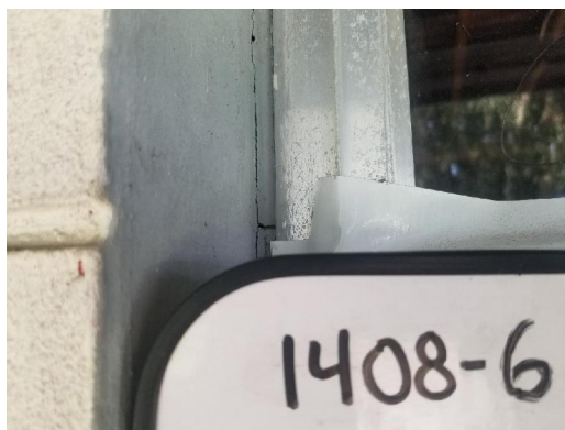
1408-6 Door/Window Caulk Typical Exterior Doors/Windows 2% Chrysotile