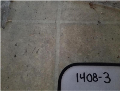
1408-3 Rolled Flooring/Mastic Interior Kitchen (Approx. 140' sq.)