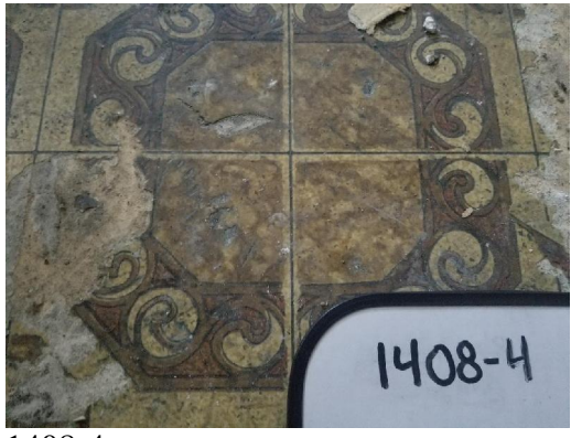
1408-4 Rolled Flooring/Mastic Interior Utility Room (Approx. 100' sq.)