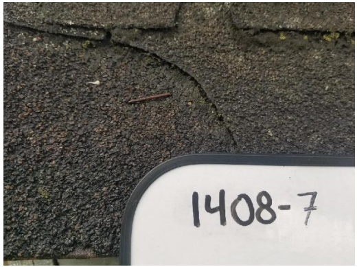
1408-7 Asphalt Shingle Typical Detached Exterior Shed Roof